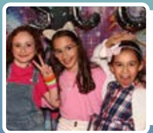
Thurs 3rd Oct