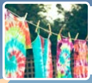
Fri 4th Oct