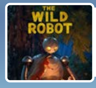
Fri 27th Sep

Enjoy a trip to Orana Cinemas to watch Wild Robot!